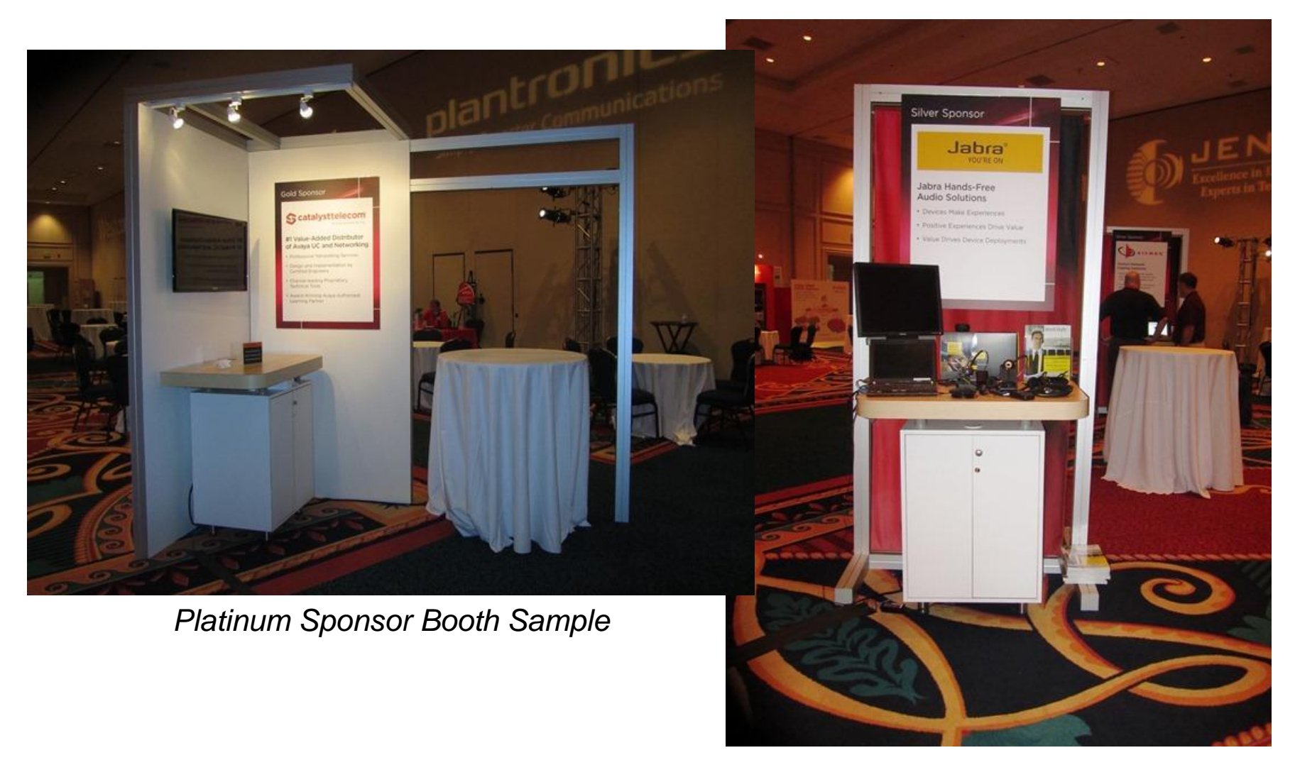
Gold Sponsor Booth Sample